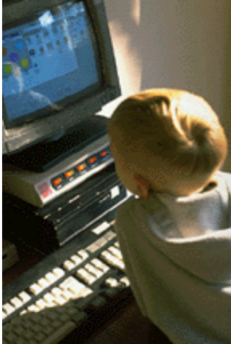
Estimating is child's play